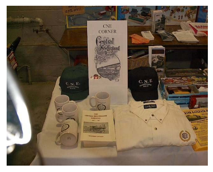
New arrivals: Stop in to see our new line of Central New England items. Caps, mugs, shirts, etc. While you're here check out other new items arriving daily.