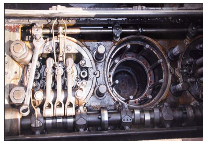
Looking down from the top deck of the engine on the SW-8 showing the number seven cylinder head removed.

Our 2014 season was an interesting one. We had four locomotives operating: the RS1 (0673), the 44-tonner (1399), the Budd Car (32) and the SW-8 (1). This is the first time in my memory that we had four operable locomotives at the same time. My thanks go to Justin and the Mechanical Department crew, who put in a great deal of time keeping us running. The 32 was nursed back to health following a voltage regulator failure. The SW-8 had a cracked head replaced, and has been fitted with new seals in all eight cylinders. No telling when this was last done! We are hopeful that the SW-8 will return to regular RYL service in 2015.