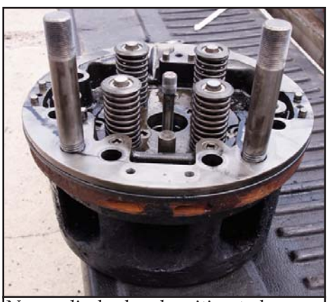
New cylinder head waiting to be installed into the SW-8's engine.

Following a careful and detailed analysis of our RYL operations, we determined that we spend an identical amount of time backing up, as going forward. With this vital information in hand, we've installed a new (old, actually) brass dump valve/backup whistle on our New Haven caboose, and our backup hose also got a new brass backup whistle, which nobody