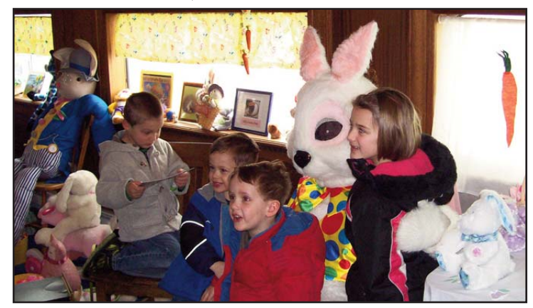
Continued on Page 6

The weather actually was very favorable for this annual Museum event. Our railroad and Easter Bunny fans filled many of our train rides, even to the point of prompting us to schedule an additional train ride on the last day of the event. The Museum garnered a total of $18,000 in admissions.