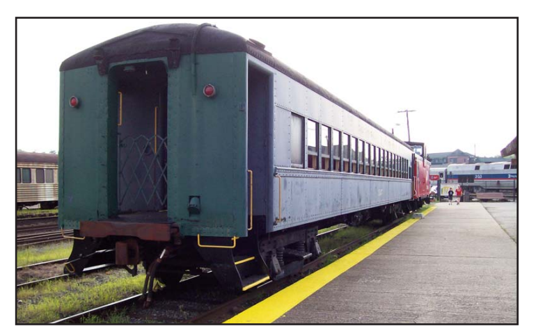
Top left, Bob Boothe, top right, Harry Leeds on the 1455, brushing on the historically-accurate color, and left, the finished result; above, Gerry Herrmann removing paint from wooden pieces from the NYCHRR caboose; left, the bright yellow safety line at Track 18; below left, the proposed footprint for re-erection of the Botsford water tower; below, progress on trackwork