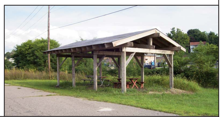
Photo showing the extended trackage in our railyard, and at right, the pavilion now with decking on the roof.

Gil Letellier has been busy with a number of projects, one of which is the pavilion at the end of track 42, which will soon have a roof. This will afford shelter from the sun for those who wish to de-train and re-board a later train. I have been encouraging train crews and car hosts to advise riders that they can ride as often as they want (that day) by presenting their tickets again. This practice doesn't apply for special events, but we have had plenty of room on our regular weekend trains to do this.