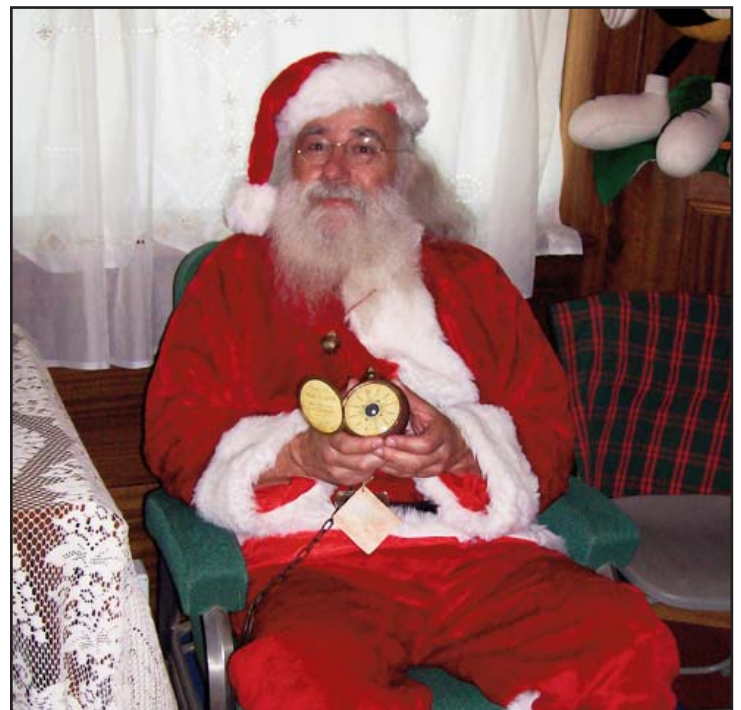
The time has arrived for Santa to be at the DRM!

Tickets are $10 for ages 2 and over, under 2 free . So don't miss out and reserve your tickets early! See Page 2 for complete information on event activities and train dates/times. Santa's waiting!