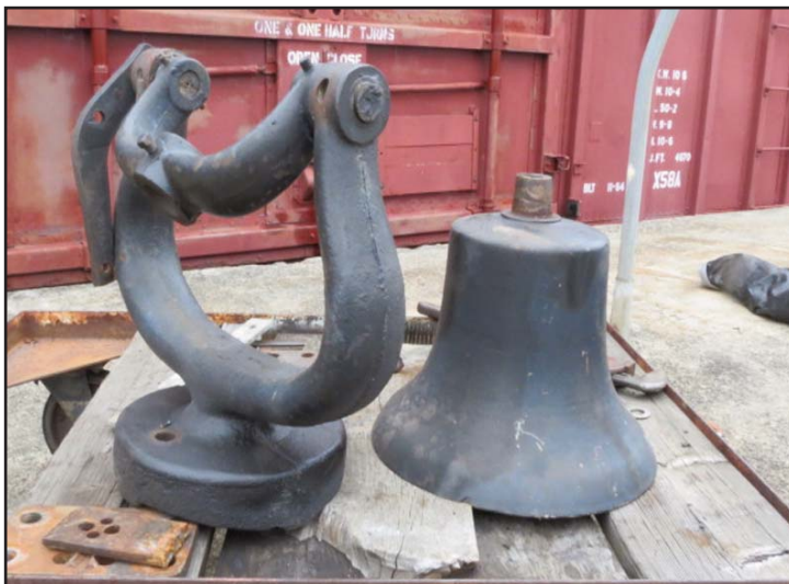
Fig.3: 1455's bell as it looked removed from her perch and disassembled.

Since the bell was now in pieces, I decided to clean it up a bit (Fig. 3). It had been painted black, probably