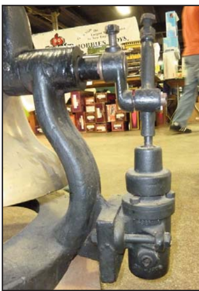
Fig.2: Gollmar automatic bell ringer as attached to a bell.

compressed air piston mechanism patented by Gollmar (Figs. 1 & 2).