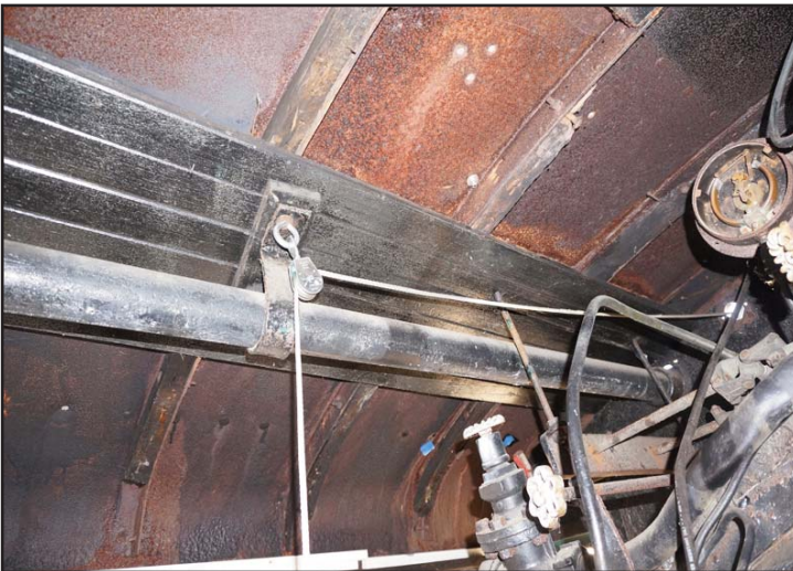
Fig.6 (left): New bell cord routing.