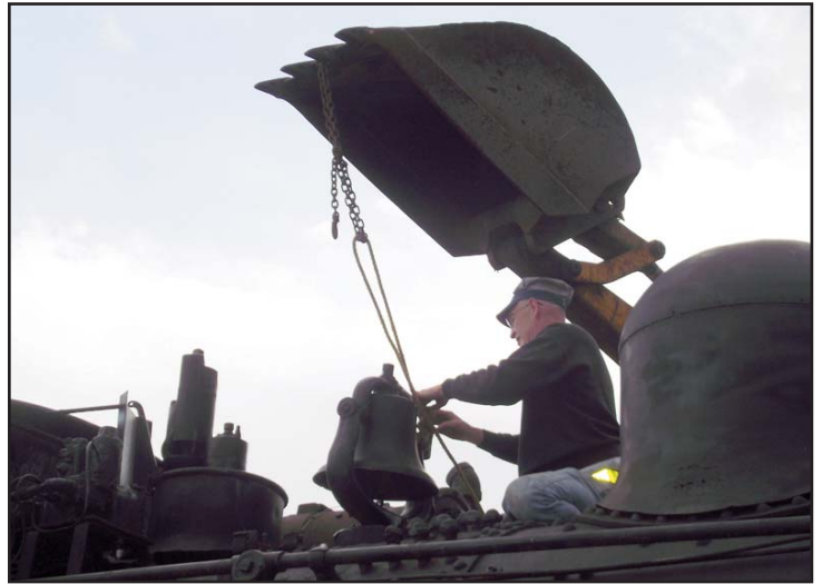
Fig. 5: Hoisting the refurbished bell back into position on top of the 1455 by means of the backhoe.