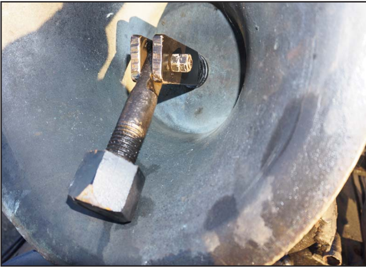
Fig. 4: New bell clapper assembled and installed in the bell.