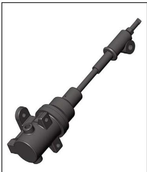
Fig.1: 3-D image of Gollmar automatic bell ringer.

The engine bell could be rung either by a cord pulled by the fireman (for short bursts), but usually by a compressed air piston mechanism patented by Gollmar (Figs. 1 & 2).