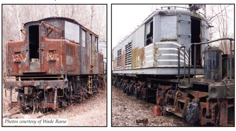
Rescue and restoration of two ex-NYC electric locomotives (1904 S1 (above, left) and 1926 T3a (above, right) motors)

Cut along dotted line and mail bottom portion in the enclosed envelope