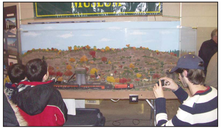
began weeks ahead, especially by Gift Shop staff. The Tuesday night train modelers found excess track and Continued on Page 4

Our booth and volunteers were there to greet the 21,458 people who attended Amherst Railway Society's Railroad Hobby Show in West Springfield, MA during the last weekend of January. Preparations