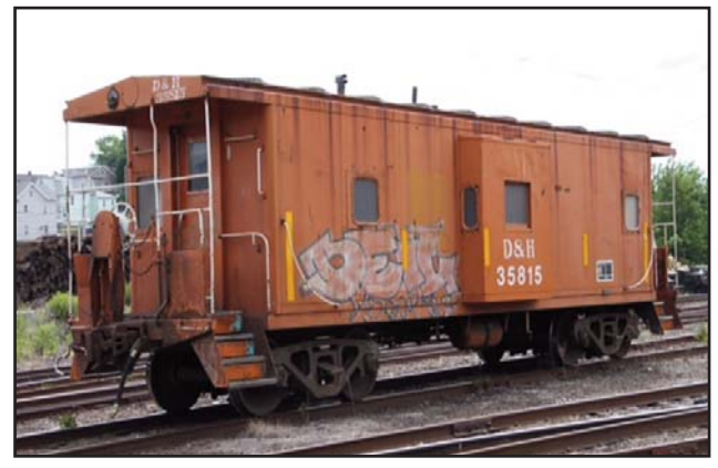
1970 EL bay window caboose needs window replacement and other restoration work