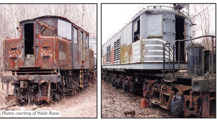
Rescue and restoration of two ex-NYC electric locomotives (1904 S1 (above, left) and 1926 T3a (above, right) motors)

Cut along dotted line and mail bottom portion in the enclosed envelope