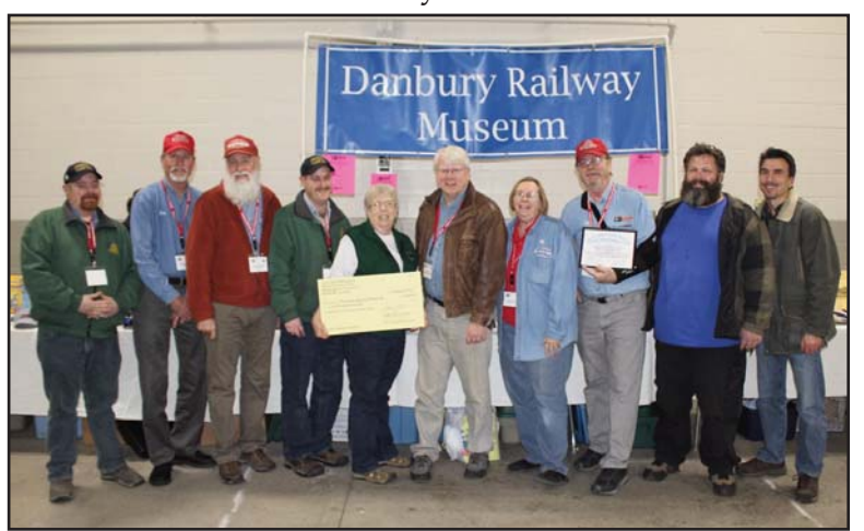
Members of the Danbury Railway Museum pose with the check and proclamation in front of the DRM booth at the Big E.