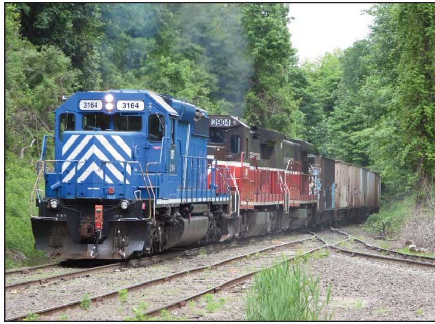
Departing the quarry site in Durham, CT.

the flat car and went into the quarry to pick up the stone train consist. As it slowly came out of the quarry yard, we noticed that a number of the hoppers used were formerly from the Florida East Coast Railway. In about a half an hour from arrival at the quarry, the train was ready to depart for Cedar Hill Yard in New Haven. Later, it