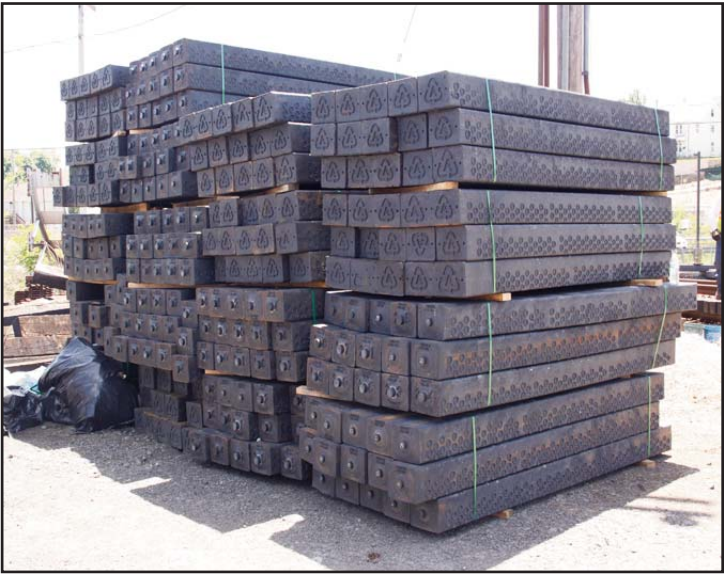
Stacked plastic composite ties.

As many people living around the Danbury area are aware, work on the many Metro-North trackage road crossings are being worked upon. New drainage, ballast, ties, tie plates, clips, etc. are being installed under a multi-million dollar replacement program to rework a marginally functioning signaling system caused by drainage problems affecting correct signal operations and sporadic crossing protection operations. Road crossing closures, which of course aggravates drivers, reduced rail service because track is temporarily removed from service, aggravating commuters, and the need for buses to complete commutes, also disdaining to travelers, are