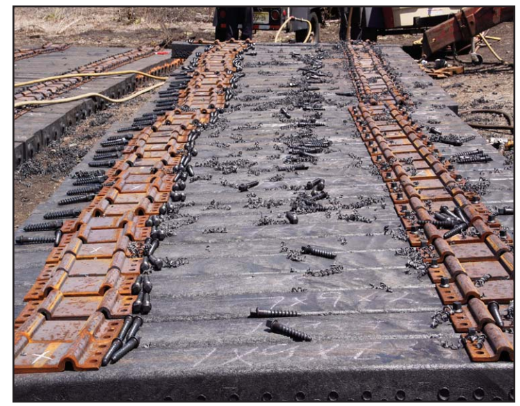
Composite ties and tie plates lined up with holes drilled out.

only some of the frustrations impacting the project. On the construction side of the project, all is not great either. Extraordinary efforts by CDOT, Metro-North, Waters Construction and Rail Construction Corporation (most recently replaced by RailWorks of New Jersey) have also had some issues with the track having the proper gauge, which was possibly caused by the incorporation of newly developed composite (plastic) ties. The solution...yup...back to good-ole' fashioned wood ties. Work continues and it seems that progress is moving right along and ahead of schedule. Everyone involved are busting their rear-ends with long hours and weekend work to bring this work to fruition. So why present this information? Thanks to all the aforementioned enti-