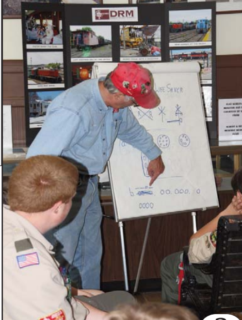
Continued on Page 4