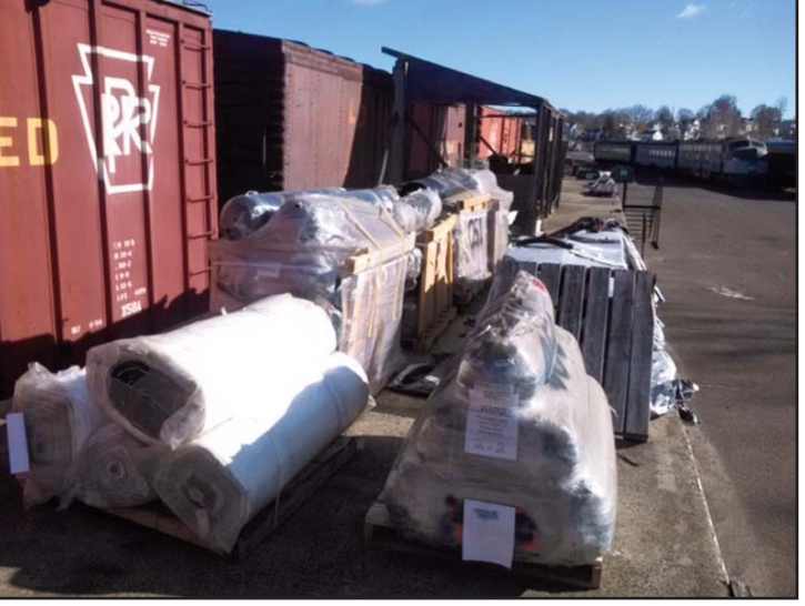
Donated track mats from Metro-North on loading dock.