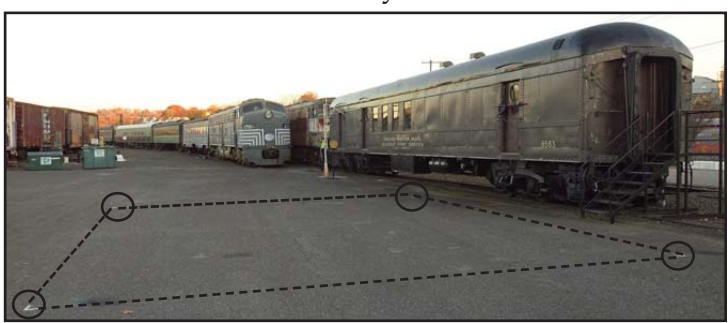
The outlined location opposite of the loading dock where the Mill Plain Station is to be located. In the photo, the mail bag stand has already been moved to its new location. After this photo was taken, the RPO car was moved out of the way down the track and positioned so the stand would line up with the mail bag catcher doorway (door with circle window on right).