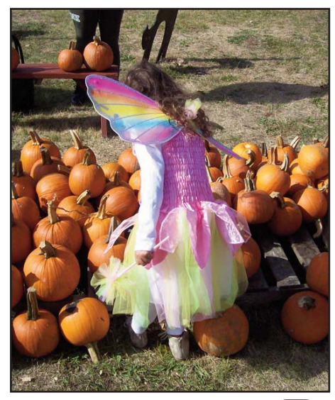
Continued on Page 6