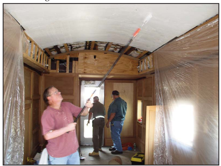
Volunteers working on the interior of the CN events car #660.

Another piece of equipment that saw some attention at the end of the year was Canadian National club car #660. This car had been in the Museum's collection since the plan for it to be used as part of a restaurant fell through. The Museum decided to turn it into the events car and work was being done on the interior to give it a more finished look.