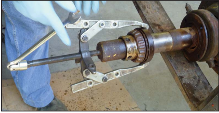
Fig.2 Double-row tapered roller bearing being removed by means of a mechanical puller.

Burro Crane Revival, Part 2 - Rehabilitation of main gear shaft, Continued from Page 1