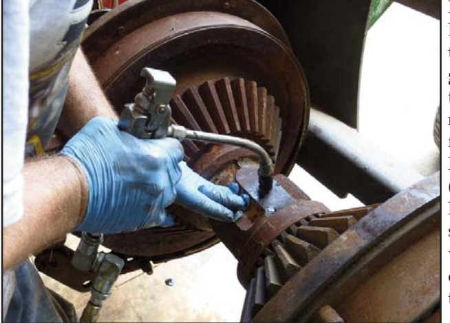
Fig. 24 (left): Lubricating the main gear shaft through a new grease fitting. Fig. 25 (right): Main gear shaft coated with "special" mixture.