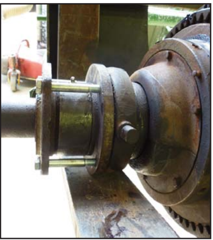
Fig. 22 Left side assembly bolted into place.