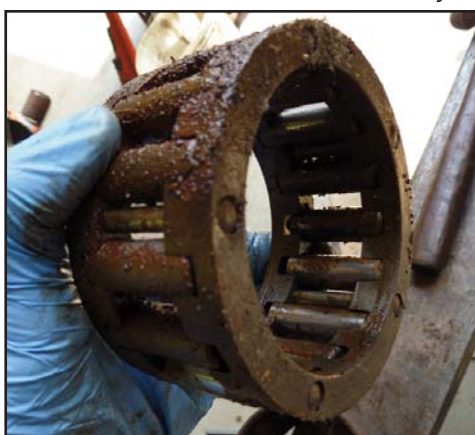
Fig. 6 Close-up of seized cylindrical roller bearing cage.

drical roller bearings had to be found or fabricated.