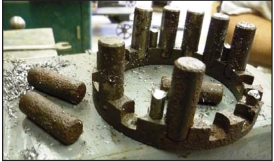
Fig. 9 Opened cylindrical roller bearing cage with rusted and pitted bearings.