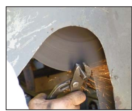
Fig. 11 Chamfering a new cylindrical bearing on a chop saw.

would fit through the holes of the cage, which had two different diameters on each side of the housings to keep the pins from poking all the way through (figs. 12-13). Then, when the bearings and new pins were in place, the ends of the new pins were peened over to form a head that would hold the bearing cage together (figs. 14-17).