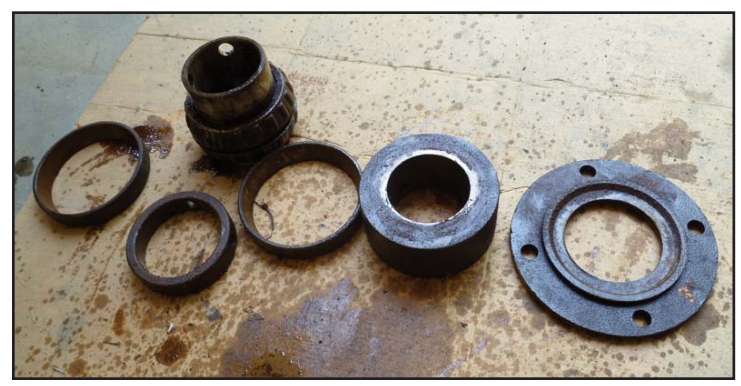
Fig.3 The different pieces that came off the right side of the main gear shaft.

water had gotten into the bearing cage sleeve and dam-