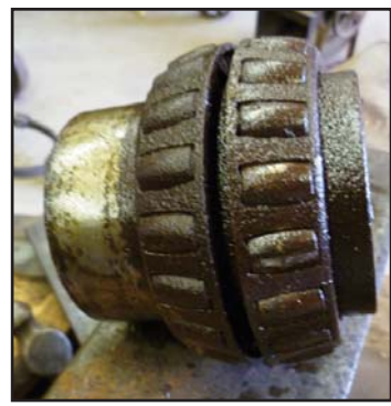
Fig. 4 Seized double-row tapered roller bearing.

Work to free the cage bearings started by drilling through the pins on a milling machine at their midpoints, which held each side of the bearing cage together (fig. 7). Five pins held the cage together which housed 15 cylindrical bearings, each pin separated by three roller bearings. Next, the halved pins themselves were removed by drilling out their heads and punching them out through the side of the cage (fig. 8). Only eight of the fifteen cylindrical roller bearings were good enough to be re-used, the others were too rusted and pitted to be re-used (fig. 9). The ones to be salvaged were cleaned up with emery cloth on a metal lathe. Seven new cylin-