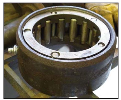
Figs. 18-19 (left & center): Roller bearing cage sleeve being turned on metal lathe. Fig. 20 Finished cage sleeve with new