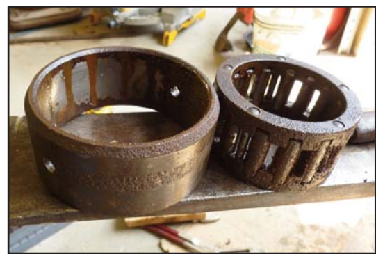
Fig. 5 Rusted and seized cylindrical roller bearing cage and sleeve (left).