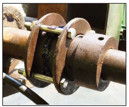
Fig. 23 Right side assembly bolted into place.