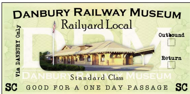
Example of standard coach-class ticket.

Drawing inspiration from the tickets Peter found and Bob's saying, "Give the kids something they'll take home and save in their cigar box of souvenirs," I went home and started the graphic design process. After a while, the presses were rolling with these designs pictured. The new tickets are printed on heavy card stock and look and feel like the real McCoy.