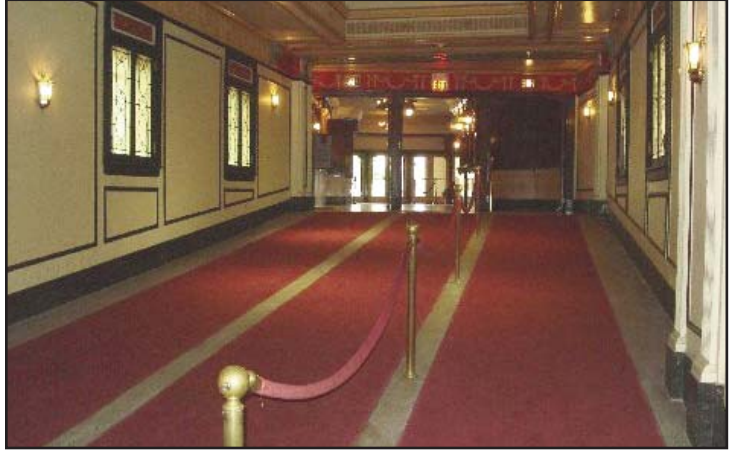
Conitnued on Page 7

Danbury's restored Palace Theatre will feature the 1974 film Murder on the Orient Express on Saturday, November 7<sup>th</sup>. This occasion will mark a joint venture between the DRM and the Danbury Museum & Historical Society. It will be a rare opportunity to view a classic film in a setting dating from a time when movie theaters really were theaters! Imagine yourself leisurely enjoying refreshments and entertainment surround-