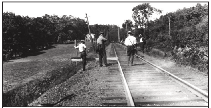
Photo of electrification from DRM Library's collection.

Look for the show to be presented at the DRM on Wednesday, August 1 st at 7:30pm!