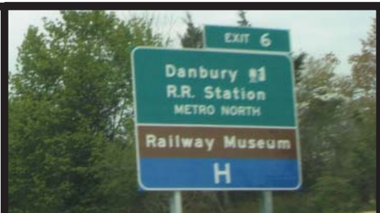
New highway sign.

See the newsletter in color at www.danburyrail.org!