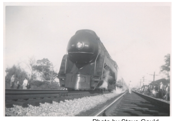
611 at photo run location Gilmerton, VA on Return trip to Petersburg.

The run back to Petersburg was fast but uneventful. At Poe, we left the mainline at dusk for Petersburg where #611 was cut off. I remember wiping my engineer's hat on one of the main rods to collect some grease. We watched as the J disappeared into the twilight, wisps of smoke seeming to hang forever in the air, knowing full well that six days later, the engine would run for the last time on another fantrip from Roanoke to Williamson. Of course, it would take two decades to re-light the firebox and allow the miracle from Roanoke to roam the Virginia countryside once again.