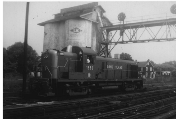
LIRR RS #1553 on a run-around move at Babylon in August 1960.