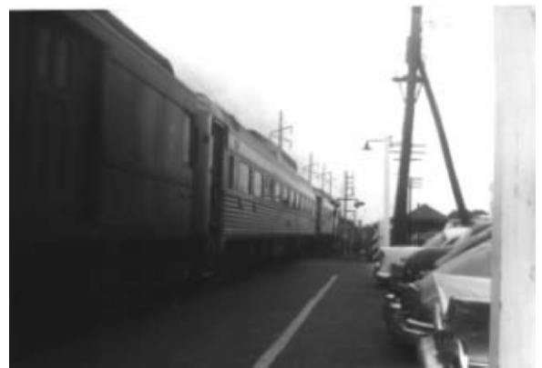
LIRR violates its Budd warranty using its entire fleet of RDC's to tow a baggage car at Bay Shore in June 1960.