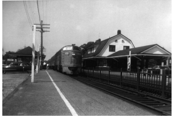
LIRR C-Liner #2402 stops at Bay Shore with a train for Montauk in June 1960.

My LIRR career came to an abrupt end late that summer when the railroad went out on strike again in sympathy with a Pennsy strike. Although, I worked not near as long as I thought I would, I did get to ride the system and get some decent shots, and learn a little of what it is like to work for the steel wheel on steel rail.