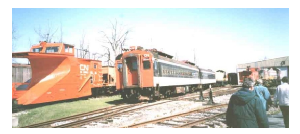
Some of the outdoor displays at the Canadian Railway Museum at Delson, Quebec.

The first "rail event" we enjoyed was a full afternoon at the Canadian Railway Museum in Delson, Quebec, which is about 20 miles south of Montreal. They have a lot of "stuff," including 140 pieces of rolling stock, but much of it is jammed coupler to coupler in two large metal sheds with poor lighting and very narrow aisles between tracks, so that we couldn't really get a decent view of any single locomotive, passenger coach, or interurban car. The rest of their collection is slowly rusting outside with little apparent preservation being attempted. They are presently constructing an $11 million "Exporail" pavilion ($7 million contributed by the Federal and Provincial governments) which will have 12 indoor tracks, an overhead mezzanine and under track observation pit, and which will house about 30 pieces of their best equipment. This will certainly improve their ability to show what they have. But there seems to be little coordination in their collection - do they really need three F-7 "covered wagons" in different paint schemes?