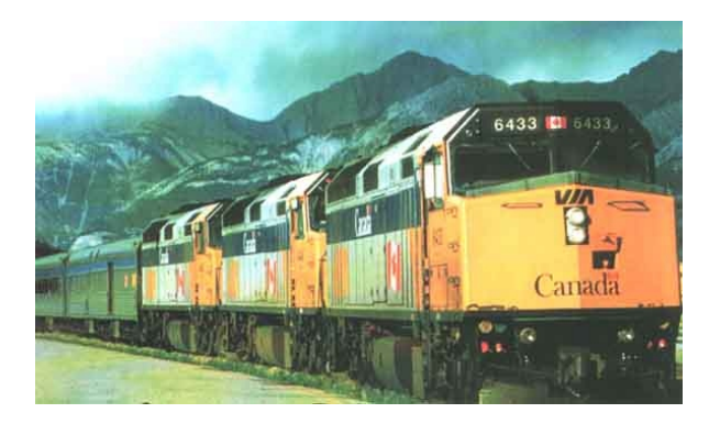
The "Canadian" during its 75 minute service stop and crew change in Jasper, Alberta.

After 2 nights and I day in Toronto, we arrived at the station to board VIA Rail's "flagship" train, the "Canadian." The original "Canadian" was operated by the Canadian Pacific Railway. In 1978, VIA Rail was created, similar to Amtrak in the U.S., and took over all CP and CN passenger rail service. Initially, most passenger service was retained, but in 1988, "the Great Shrinkage" occurred when the Canadian government reduced passenger train subsidies. At that point, VIA Rail transferred the "Canadian' from CP's tracks to CN's, and reduced the frequency from every day to 3 days per week. In 1992, VIA Rail took 190 of their 1955-vintage Budd-built stainless steel cars, and spent over $200 million refurbishing them from the trucks to the domes. The result is the "Canadian" you ride now.