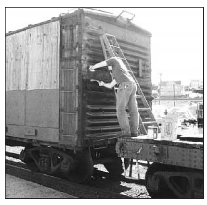
Rome applying rust stabilizer thathe A end with view of partly painted plywood.