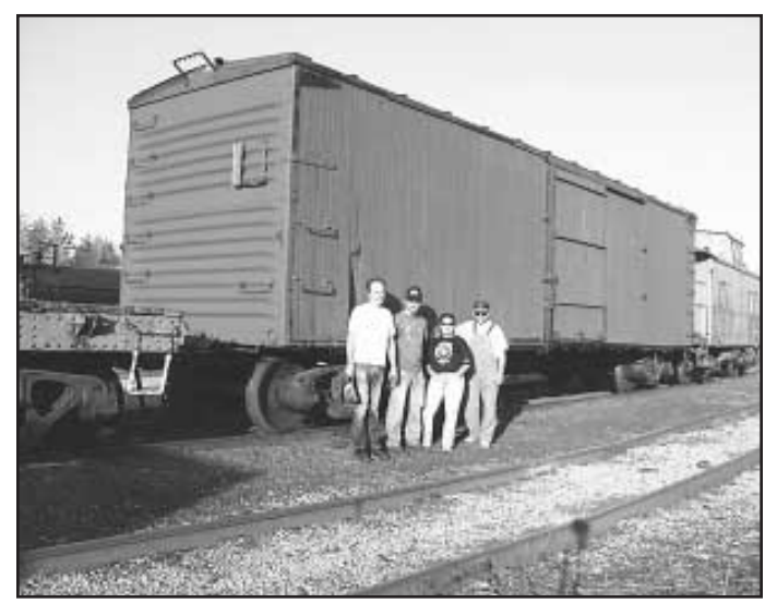
The crew and their "Masterwork"!

We will schedule another restoration session for early November to apply simplified lettering to the "good" side and work on the roof. We hope to have time to work on the flat car too.