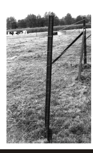
Light rail track used as by a French farmer as fence post. Sept. 2002

On our way to the airport and home we take in a last bit of railroadiana. In the Forest of Compeigne, we visit the standard gauge siding where stands a replica of the dining car in which the Armistice ending the Great War was signed on November 11, 1918.