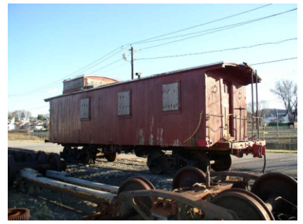
And finally the Caboose is at it's New Home in The Danbury Railway Museum Railyard!

Brakes had to be freed-up, bearings polished and oiled and track had to be repaired before we could roll it.