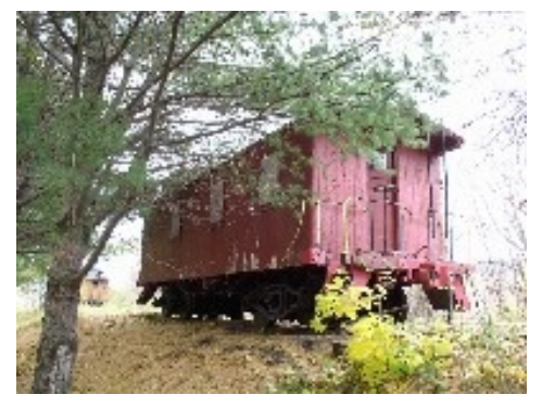
An Early 1900's Wooden Caboose Donated to the Danbury Railway Museum by the <u>Connecticut Railroad Historical Society</u> Originally Built for the NYC&HH RR