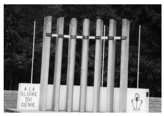
Monument to French army engineers. Chemin-de-fer is third pylon from right. Sept. 2002