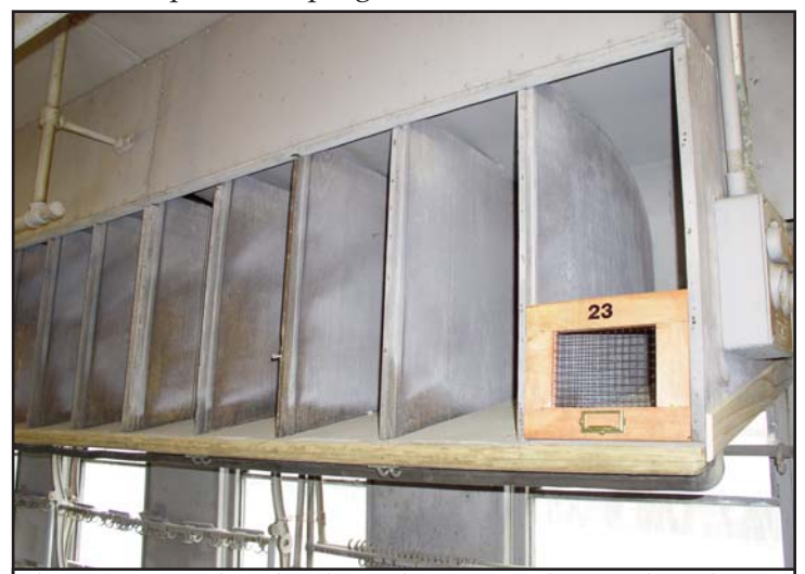
The # 23 stained and polyurethane coated paper box door is shown in place. It now has a label holder with pull. Other paper boxes and the rows of first class letter slots are shown in photos. Below, a handsome, portable sorting tray that was made, stained and polyurethane coated at home.

This past month has been a slow one; first, because of the cold weather, and secondly, the things that we can do at home have for the most part been completed. The past two weekends did give us a little break, and we did get some bag hooks removed and have started to clean them up; we will be continuing this during the next few weeks. We also did a small amount of paint scraping.