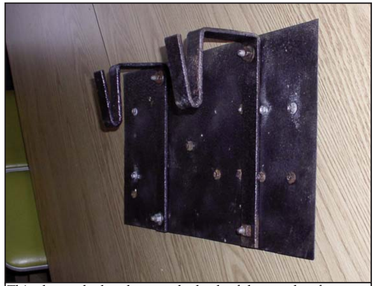
This shows the brackets on the back of the number for hanging it below the signal tower.

Signal Tower Number, Continued from Page 1