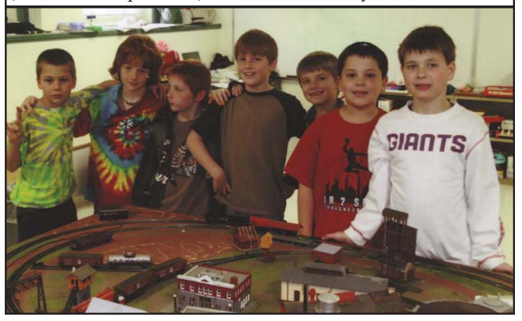
Continued on Page 7