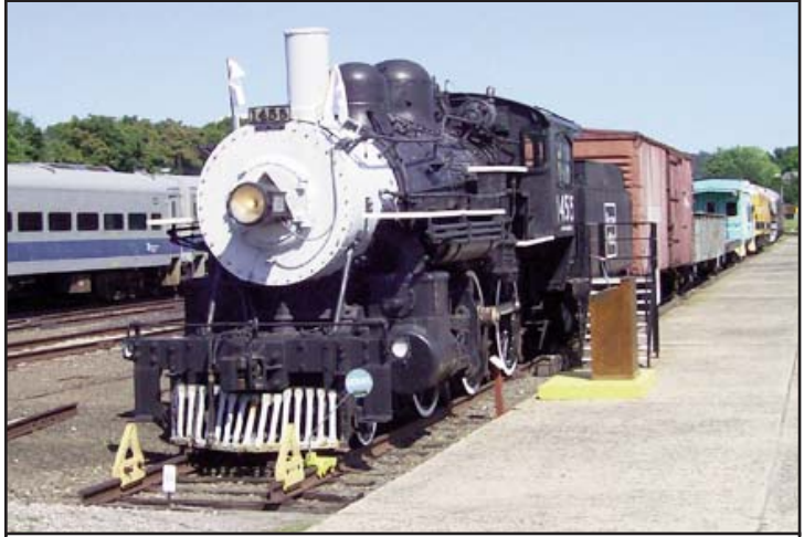
The #1455 flying white Special Train flags on Danbury Railway Day in August 2007.

The other big new item was the purchase of Boston & Maine 2-6-0 #1455 on March 4, 1999. Completed in November 1907, the engine served