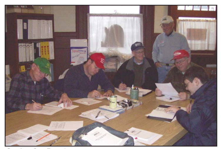
Continued on Page 6