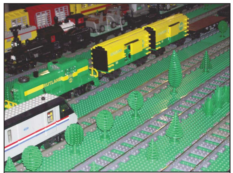
Bottom photo from a NELUG show and taken from the NELUG website. show part of their immense layout at "Big E" in January.

For the duration of this special exhibit the Museum's admission will be $7 for adults, $6 for Seniors, and $5 for ages 3-13. Members and children under 3 will be admitted free. Admission also will include all the other regular attractions. Train rides on the weekends will cost the usual additional amount, except for on National Train Day on May 8th, when the rides will be free for everyone with paid admission.