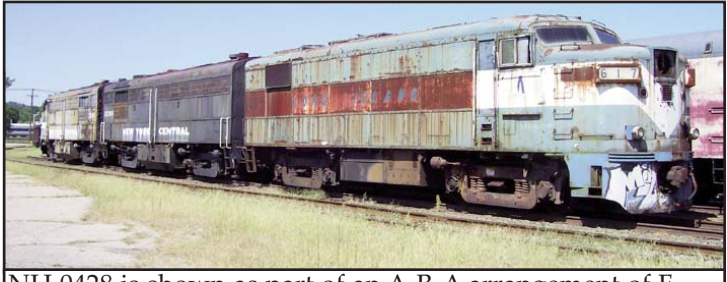
NH 0428 is shown as part of an A-B-A arrangement of F units in our railyard last August.

It is a diesel-electric FA-1 built in October 1947. FA-1 stands for freight A unit, meaning it had a cab, which the B units did not. FA-2 came out later and had more horsepower.