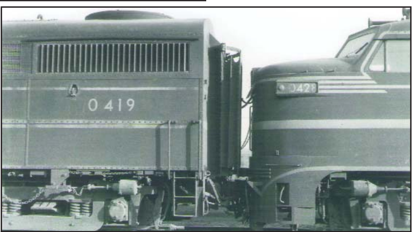
Photo taken by Pete at Newtown, CT, train NO-1("N" for Cedar Hill and "O" for Maybrook, the destination) on March 1957 shows a closeup of how she looked elephant style.

FAs on a heavy freight were excellent. The 0428 and her sisters were good pickup units, rode well even at 50mph (west of Hopewell Jct.). On a heavy grade they could get down to 7mph, full throttle, and not blow up or have problems. Now one thing about traveling at that speed and throttle was that your fireman now had to check each unit individually for overheating and overamps. However you very rarely came upon this problem.