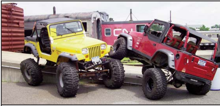
There was plenty of parking space, so... ?

www.danbury.org/drm . The Museum's New Haven forge was in operation, and refreshments were available. G-gaugers ran garden railroading size equipment on a special layout set up on the 18 track platform. All this was in addition to the usual weekend operations