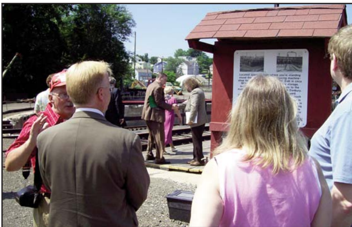
Viewing educational signage before riding on the turntable.

The New Haven 0814 "Carol" began service on the railroad in 1945, as one of a total of 18 such locomotives owned by that railroad. It was sold to Electric Boat in 1959.