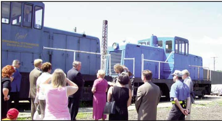
The objects of their affection, the 44 tonners, viewed by those attending the ceremony. The locomotives were located near the historic turntable for mechanical assessment.

On the morning of July 14 th , the Danbury Railway Museum welcomed the principal people involved with saving these vintage locomotives, as well as DRM members, the press, and local elected officials to a formal celebration. We wished to extend our gratitude to them, and give a welcoming tour of the Museum, including the building, a train and turntable ride. Please refer to DRM President Ira Pollack's column on Page 3 for more details.