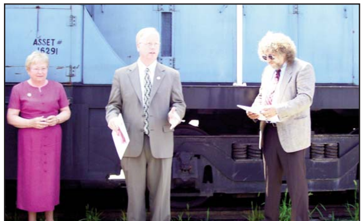
City of Danbury Mayor Mark Boughton addressing the group of people gathered to celebrate the occasion.