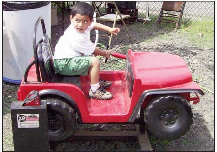
Above, a young jeep fan on the popular coin-operated ride. Below, our vintage steam locomotive with a vintage jeep pickup truck.