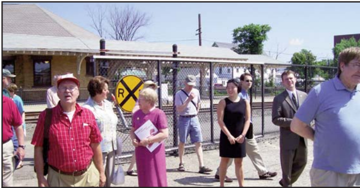
After entering our railyard, everyone rode on the #41 RDC Budd car (below) to the Museum's historic turntable.