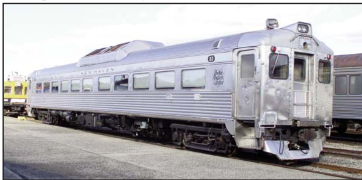
Our RDC #32 Budd car has seen regular use in the DRM railyard, especially in the colder months of the year.