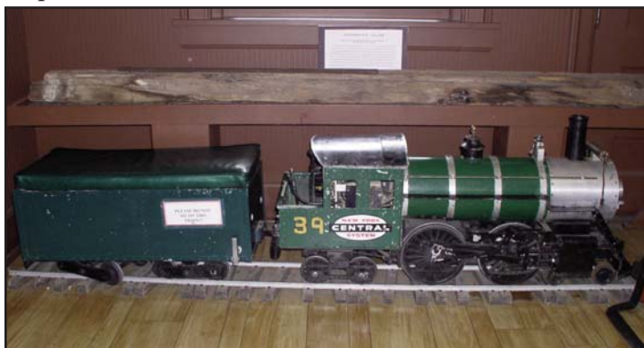
The inch-and-a-half scale engine and car make an impressive exhibit for visitors to the Museum building.

A purchase of an Inch-and-a-Half Scale engine, car and track was made, with the plan of setting this up in the yard as a riding scale railroad. This was to be a permanent fixture, but only lasted a few years. Don Silberbauer was responsible for the purchase and implementation of the railroad.