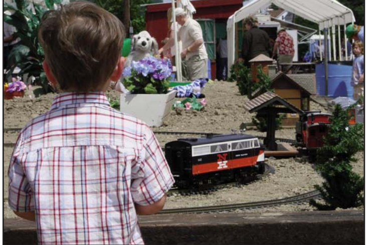
Young man mesmerized by the new G-scale layout in the railyard.

Berlin, Germany Lititz, PA Langhorne, PA Tarentum, PA Tahlequan, OK West Wyoming, PA Dalton, GA Calbridge, Ireland Anniston, AL Sunbury, PA Cotati, CA Northbridge, MA Roversford, PA Wilmington, DE Bellevue, WA Auckland, New Zealand Winnipeg, Canada San Francisco, CA E. Stroudsburg, PA