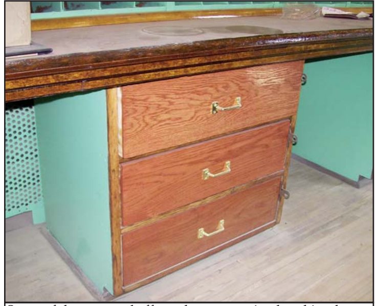
Some of the personal effects drawers, stained and in place in the RPO car. Bill Nickelson used the one remaining original drawer as a guide for creating the eight additional ones.

The baggage room on the car is being repaired and painted. We hope to stow and exhibit some Railway Post Office memorabilia there.