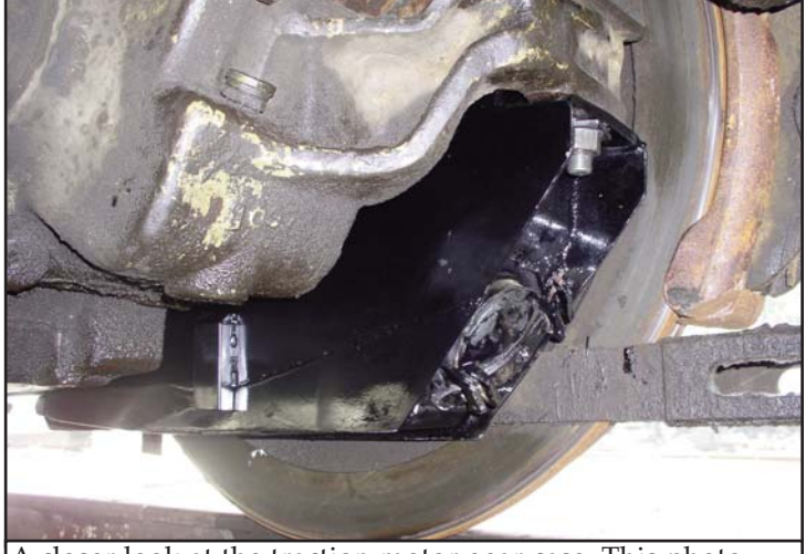
A closer look at the traction motor gear case.

maintaining our equipment. In addition to our rolling stock of railroad equipment, that includes our trusty backhoe, dump truck, pickup truck, and lawnmower.