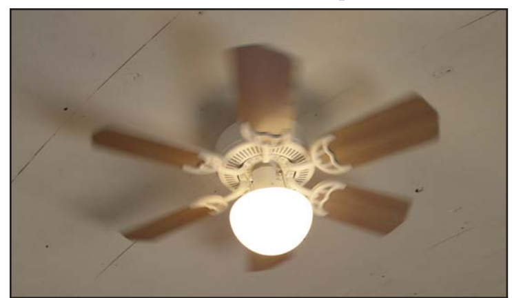
Several of these combination light/fan ceiling fixtures have been installed in the CN party car. Through a concerted effort by many volunteers, it has also now been painted inside and equipped with heaters. Unlike the coach of previous years, this car does not have rows of seats, so there was plenty of space which DRM people enthusiastically filled with decorations in preparation for the Santa's arrival. No sneak previews in the newsletter! Afterward, the car will be available to use for other DRM events.

I always like to look back and review some of these events and try to praise them and the people responsible for these successes. Of course, there is always so much going on it is hard to note them all and to acknowledge everyone involved. We are a dedicated group, a passionate group, with a commitment level to our cause that is truly unsurpassed. I honestly wish I could thank you all personally for what you have all done for the growth of the Museum on a daily basis, but of course that is almost impossible. I am