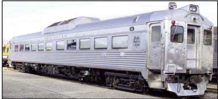
We use the RDC #32 Budd car for colder-weather holidaytime Santa Train rides.

order to keep the doors open. Event planning was also taking place with the first ever Easter Trains to be run, another Spring Train Show, Holiday Express trains and Santa Trains.