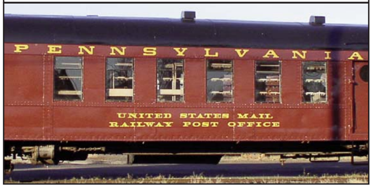
It looks terrific! Lighting is complete with the exception of the motion detector switch, which needs some minor adjustment. We still need globes for the fixtures,