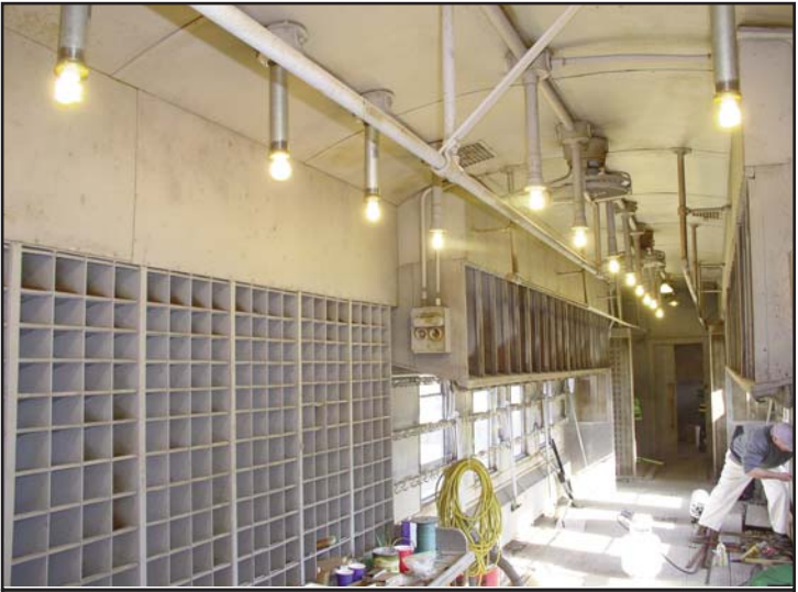
The RPO with lighting. The motion detector switch will save energy by turning on the lights when needed, and automatically shut off the lights when no one is in the car.