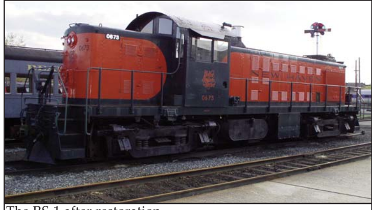
The RS-1 after restoration.

Funding was a major issue addressed in the newsletter. It was announced that a new committee was to be formed that would look at news ways to bring money into the Museum. At the time the Museum was looking for additional funds to help pay off the RS-1 bank loan and to help with the restoration