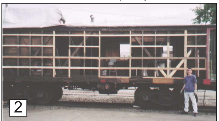
frames were fabricated by John Fegley, and installed in the window openings. A photo and explanation of the difficulties in completing the center window are in the "Little Red Caboose" article in the September 2006 issue of The Railyard Local.