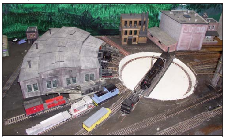
Scenes from the HO layout, which is nearing completion.

HO Gauge : Progress on the HO gauge continues. We should be seeing operation in the near future . . . stay tuned.