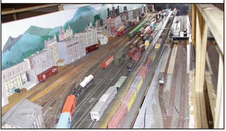
S Gauge: Not much new to report.

O Gauge: We have approached a number of materials dealers in an attempt to secure donations toward the construction of the new O gauge layout. If any of our members know of possible donors please contact Rich Shubar or myself.