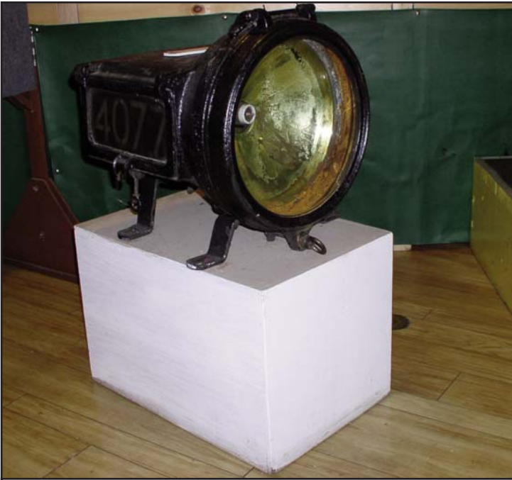
This headlight is on display in the Museum alongside the model train layouts. The informational caption states: "Headlight #4077 - This came off of an electric commuter car which was numbered 4077. The commuter car was built in 1907 and the headlight was built approximately in 1920."