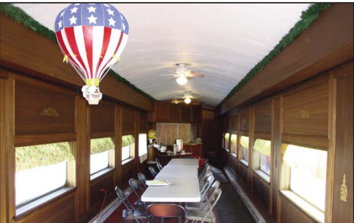
Before and during the meeting.