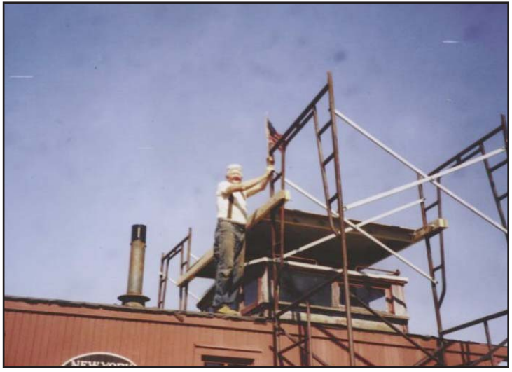
going back many years to when skyscrapers were built with steel beams by steeplejacks. When the skyscraper skeleton was completed, an American flag was raised to signify that there were no fatalities during the construction.

Dave Roberts and I fabricated the temporary roof with 2x4's and plywood attached to the scaffolding, which has wheels and can be moved during the