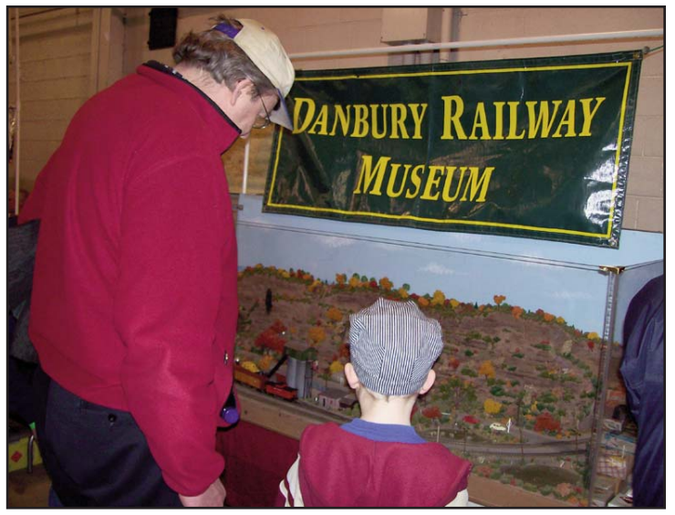
Continued on Page 6

Nearly 20,000 train enthusiasts attended Amherst Railway Society's long-awaited train show in West Springfield, MA on January 24 and 25, and the DRM had a booth and staff there to greet them. The