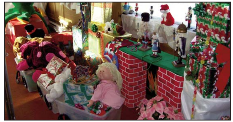
days G-gaugers ran a holiday-themed model train. Many thanks to all the dedicated volunteers who made this event possible! The enthusiasm of many who were helping during the event was evident from their smiles, costumes and decorations. The

caboose near the CN car was popular, along with other pieces in the railyard open to the public. Some