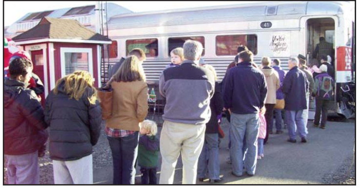
railyard to see more decorations and the New Haven caboose "dressed for the occasion" revolving on the historic turntable operated by one of our elves. Upon disembarking after the return trip, they greeted Frosty, and entered Santa's special car. It now is heated, light-

We've Been Good, Santa!, Continued from Page 7 Passengers on our Santa Express traveled down the