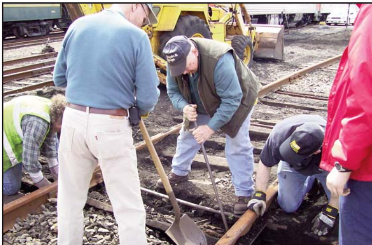
Continued on Page 4

We started tie replacement beginning on April 7<sup>th</sup> with Track 34. First dirt and stone had to be shoveled off of the ties so that we could assess their condi-