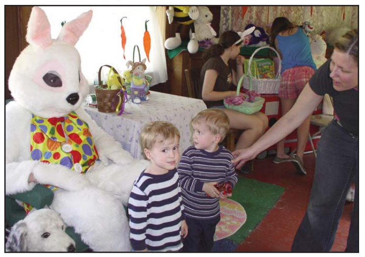
Continued on Page 4

We hope the photos shown here portray at least some of the excitement and joy of this annual Danbury Railway Museum event. Some of the volunteers pictured regularly donate their time and skills; others make that extra effort to help when additional staff is needed for an event such as this. All are needed in order to make it a wonderfully memorable occasion for our guests. Looking at these photos, can you see why our volunteers find it particularly satisfying to assist on these days?