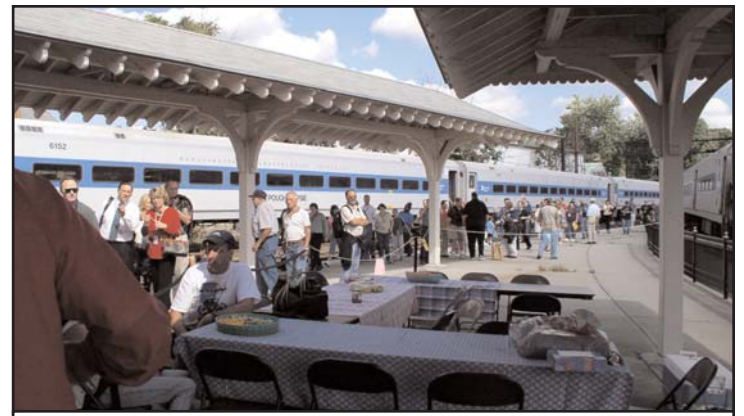
Riders of the Metro-North fan trip disembark the train and descend upon the Museum.

The train was scheduled to arrive at the DRM at 2:50pm, but arrived...early? Yes, early. Who would have thought. It is a good thing our volunteers are so