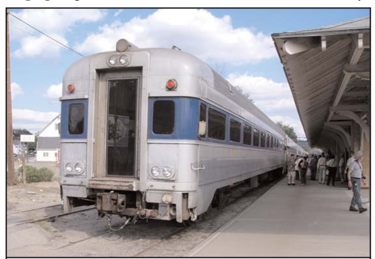
Sixty first-class passengers rode the special train in the Phoebe Snow cars. They were built by the Budd Company in 1949 for the Delaware, Lackawanna, & Western Railroad. Now they are used as Metro-North's Business/Inspection cars for senior operating management.

The DRM volunteers really enjoyed having a large group visit the Museum. The event was run very