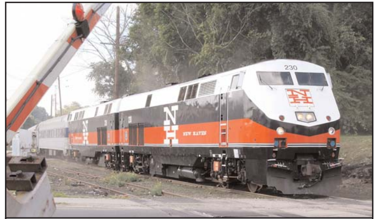
"New Haven" painted Genesis locomotives pull the special Beacon Line train into the DRM station.

On Sunday, September 12th, a Metro-North Railroad special rail fan excursion stopped at the