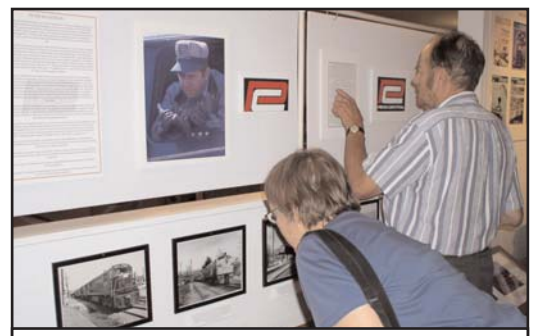
DRM volunteers were among the first to view the new photo exhibit.

Museum's newest exhibit: Changing Tracks: The Penn Central Railroad 1969-1976 . The exhibit features historic