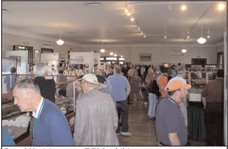
Over 300 visitors saw DRM exhibits.

versatile. The staff was going to be stationed at the various exhibits in the yard and run trains back and forth in the yard for the little over an hour the riders were scheduled to visit. Their early arrival led our operations staff to do some quick thinking and get the