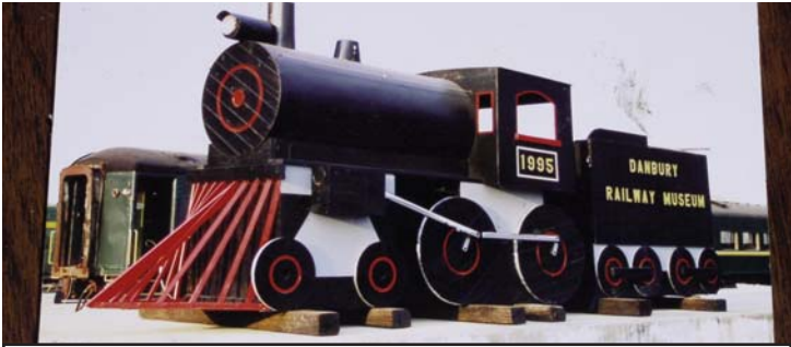
The float, when new, in a photo from the Still River exhibit at the DRM. Now, as very noticable display near the rear railyard gate, it desperately needs rebuilding.

The DRM participated in the Newtown Labor Day Parade. Our wooden locomotive float was used and came away with the prize of Best Float. Local newspapers covered the event.