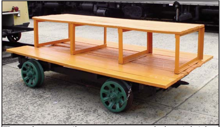
The track motor trailer car on our center platform is brightly visible with its orange and green paint scheme.

Museum, was used on the Housatonic Railroad in the 1830's. Before the advent of T rail that we know today, railroads used iron strips fastened to pine timbers. Many times the strips would become loose, curl and present a danger to the train. Railroads soon replaced them with the T-rail and it is estimated that this was done on the Housatonic about 1844. Local farmers would use the timbers for their structures. Our piece was used for the joists in the Corn House on the Crosby Farm located on the New Milford-Brookfield border.(Editors Note: The May 2005 issue of The Railyard Local has an article by Stan, plus a photo, of our strap rail artifact.)