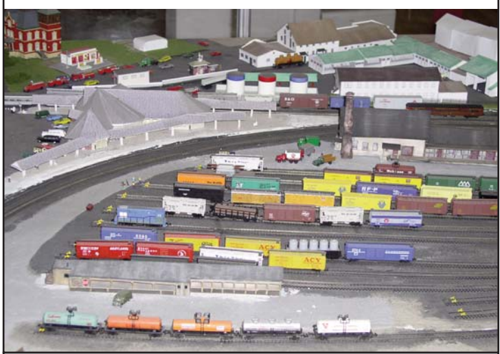
The N-gauge layout at the Museum, representing the railyard as it was in the 1950s, gives visitors a historical perspective of our railyard.

N gauge: The N gauge was a real map to visitors in the Museum during the Little Engine That Could. As usual, it gives visitors an introduction and bird's-eye view to the railyard.