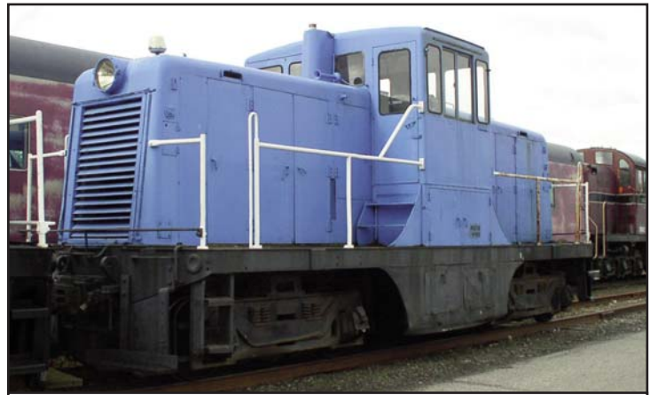
Just arrived in our railyard, originally a GE demonstrator, now with a bright blue paint job(above), and the former New Haven #0814, the one in lighter blue (below).

Two Locomotives Bring 88 Tons of Joy to DRM, Continued from Page 1