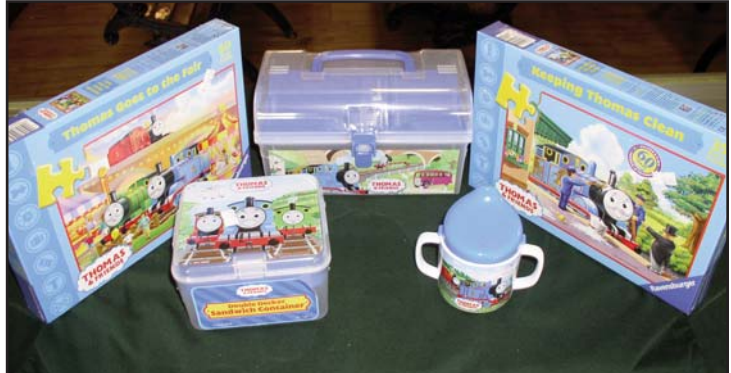
Some of our Thomas items include the Thomas & Friends puzzles, sipping mug, double decker sandwich container, and treasure box.

Thomas the Tank Puzzles : We have added a number of new puzzles to our selection.