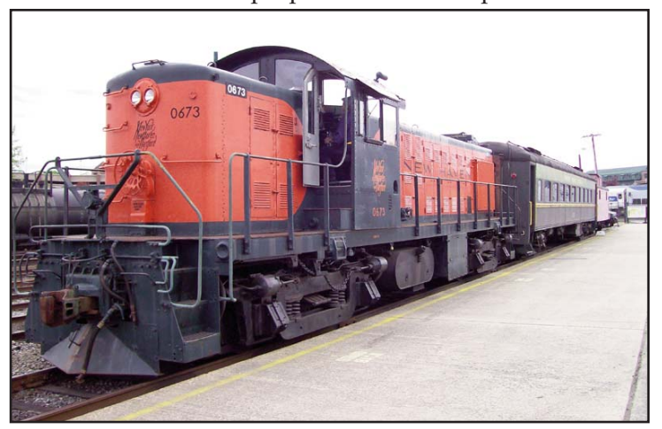
Continued on Page 7

Our members were overjoyed to have our beloved locomotive back in service on May 10<sup>th</sup>, heading up a consist for the first time in a few years. The Museum had recently engaged a professional mechanic to assess its condition. One of the problems was that a faulty water pump had caused water to mix into the oil, so we replaced the pump, drained out the fouled oil, and kept replacing filters to rid the new oil of remaining water contamination. We were wearing big smiles the day it ran again, and this Alco engine with its orange and dark green livery is a crowd pleaser, for sure! The Museum will address any remaining mechanical issues that crop up in order to keep it in service.