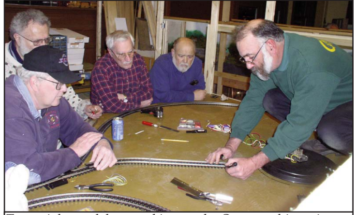
Tues. night modelers working on the O-gauge this spring.