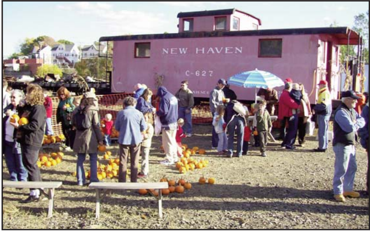
Continued on Page 7