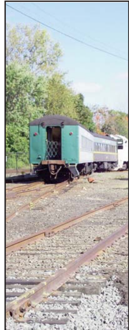
Running again on Tracks 42 and 34!